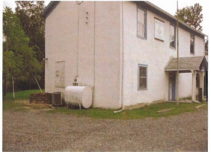
Side of Building, A/C Unit & Oil Tank